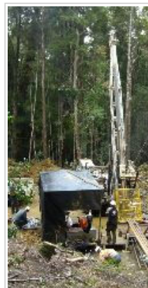
Drilling at Venture Minerals' Mt Lindsay project

Click here to read the rest of today's news stories.