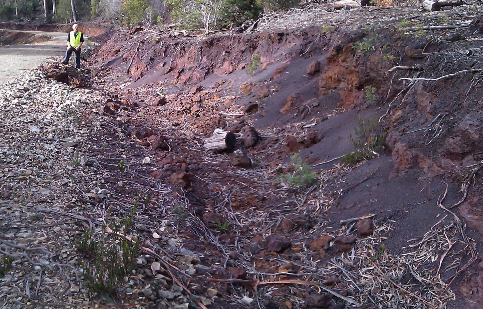
Riley Creek DSO Prospect